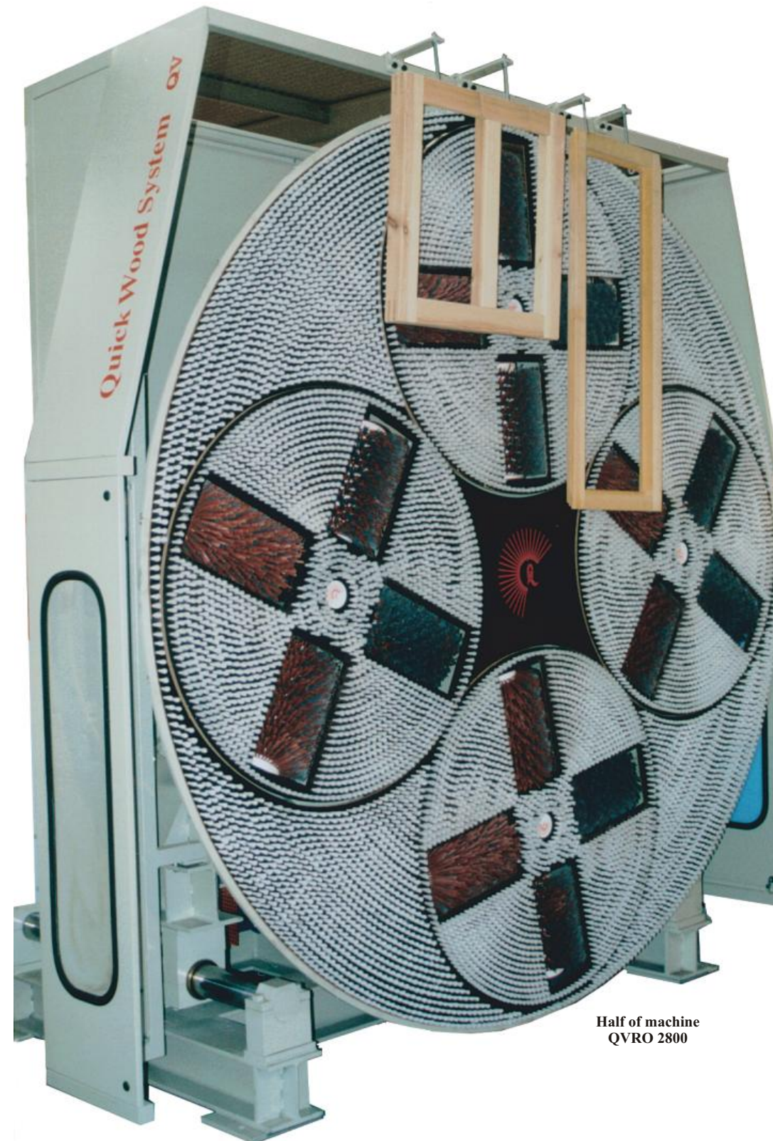
Half of machine QVRO 2800